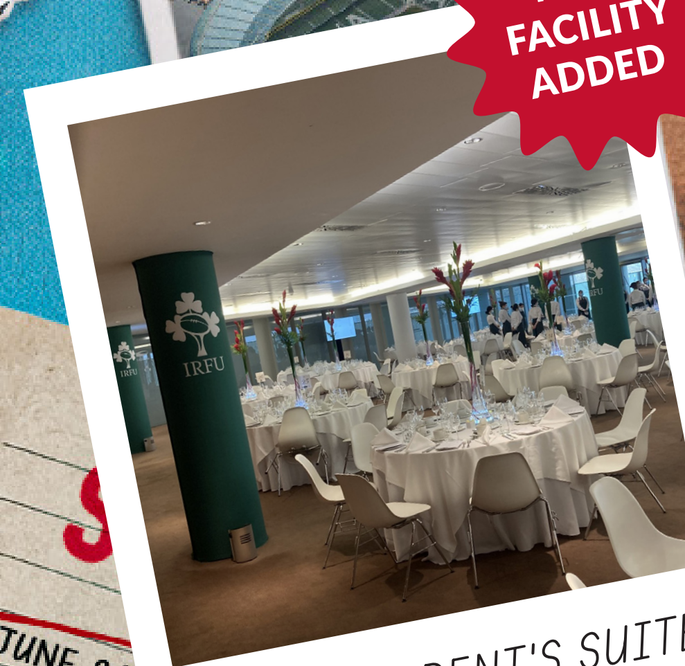
THE PRESIDENT'S SUITE