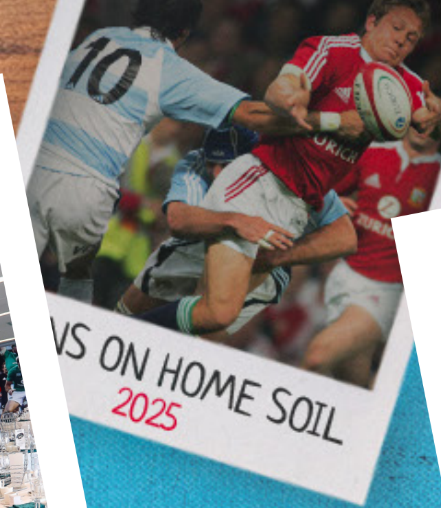
VS ON HOME SOIL 2025