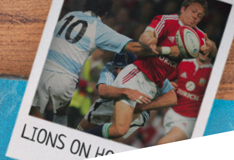
LIONS ON H