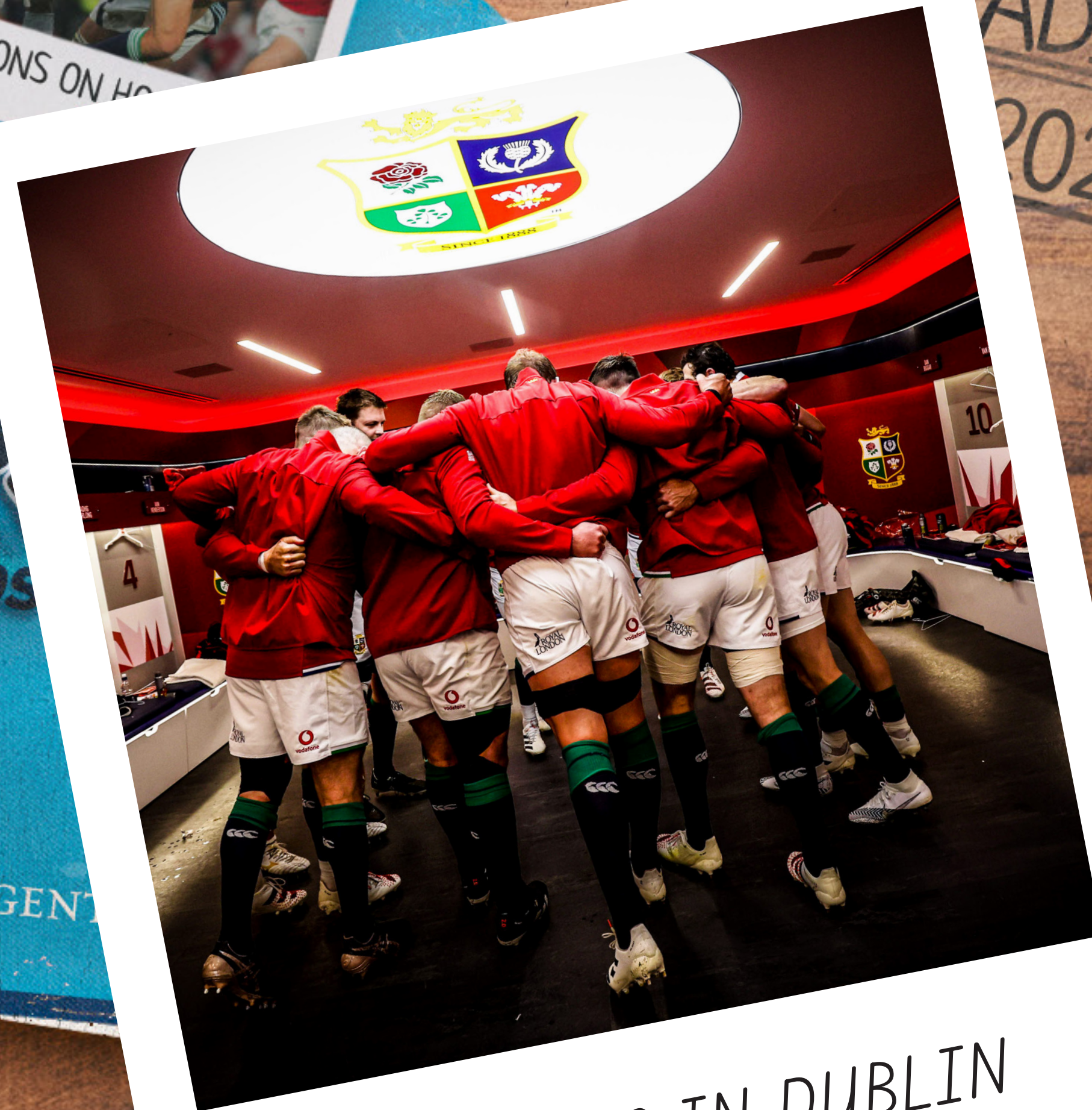
THE LIONS IN DUBLIN

This is going to be an iconic occasion in Irish sport, as Ireland's head coach Andy Farrell will lead the team against a talented Argentinian side.