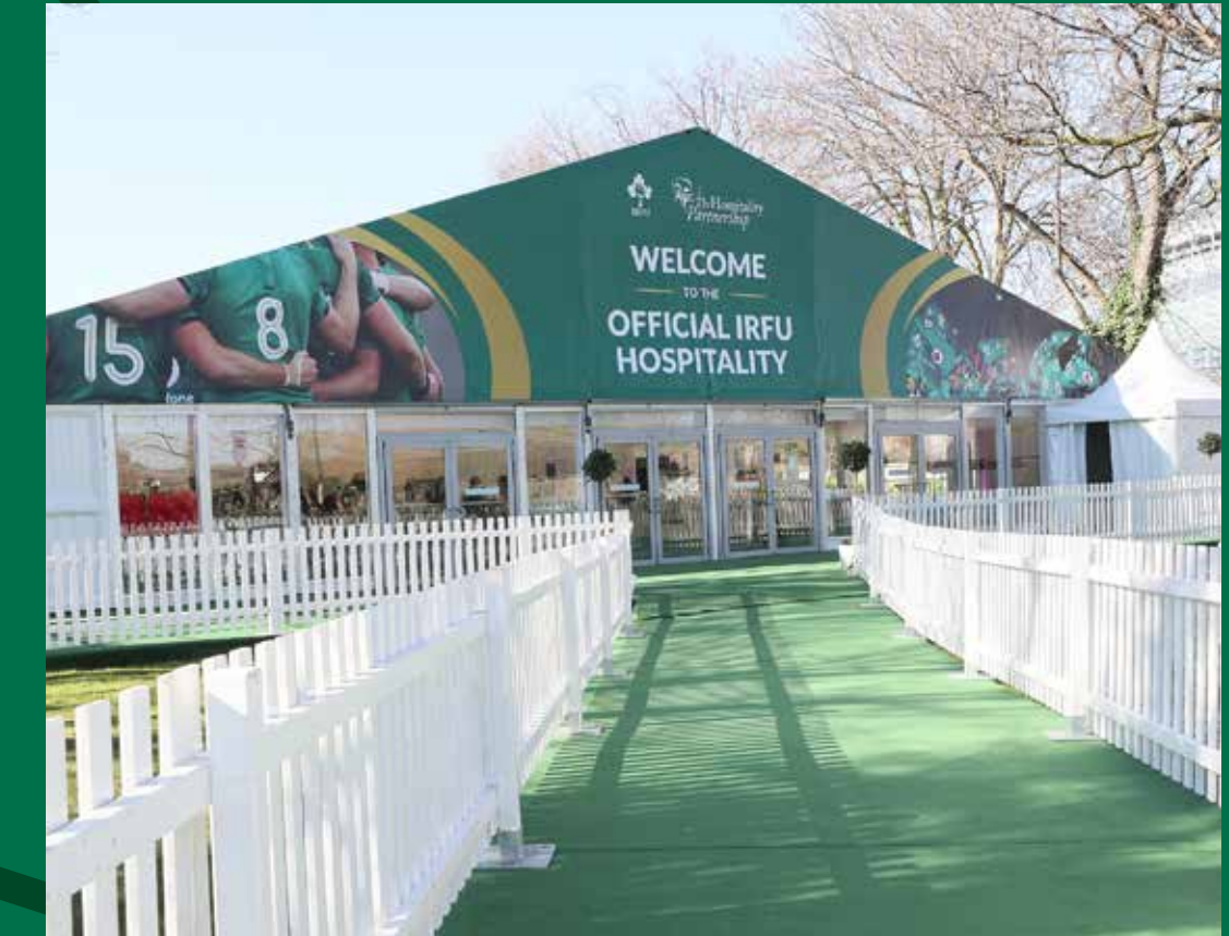
MARIAN COLLEGE MARQUEE

The Vavasour East Room is located on level 2 inside the stadium and is glass fronted overlooking Lansdowne Road. This room has a capacity of 100 guests and the match tickets are located in the East Lower Stand, Block 103/106/107. Private tables of 10 or 12 apply with small groups being catered for on shared tables.