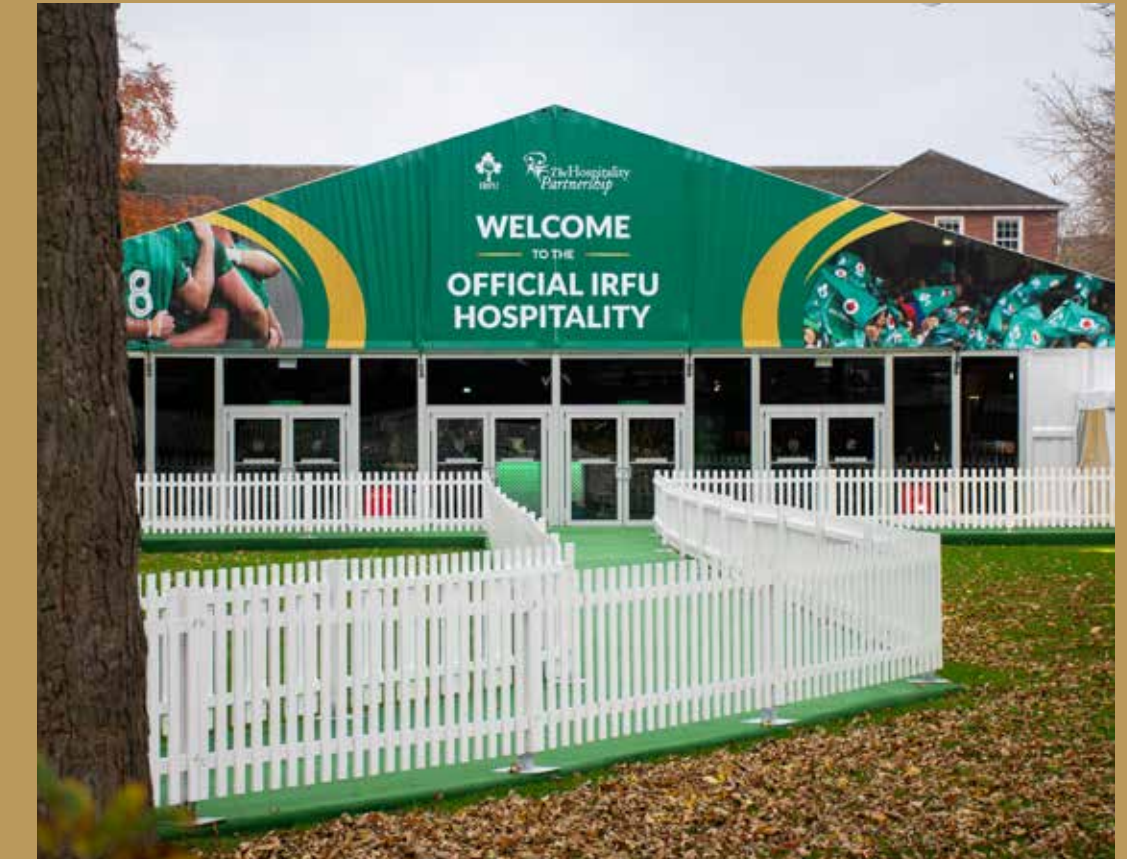
MARIAN COLLEGE MARQUEE

The Vavasour East Room is located on level 2 inside the stadium and is glass fronted overlooking Lansdowne Road. This room has a capacity of 100 guests and the match tickets are located in the East Lower Stand, Block 103/106/107. Private tables of 10 or 12 apply with small groups being catered for on shared tables.